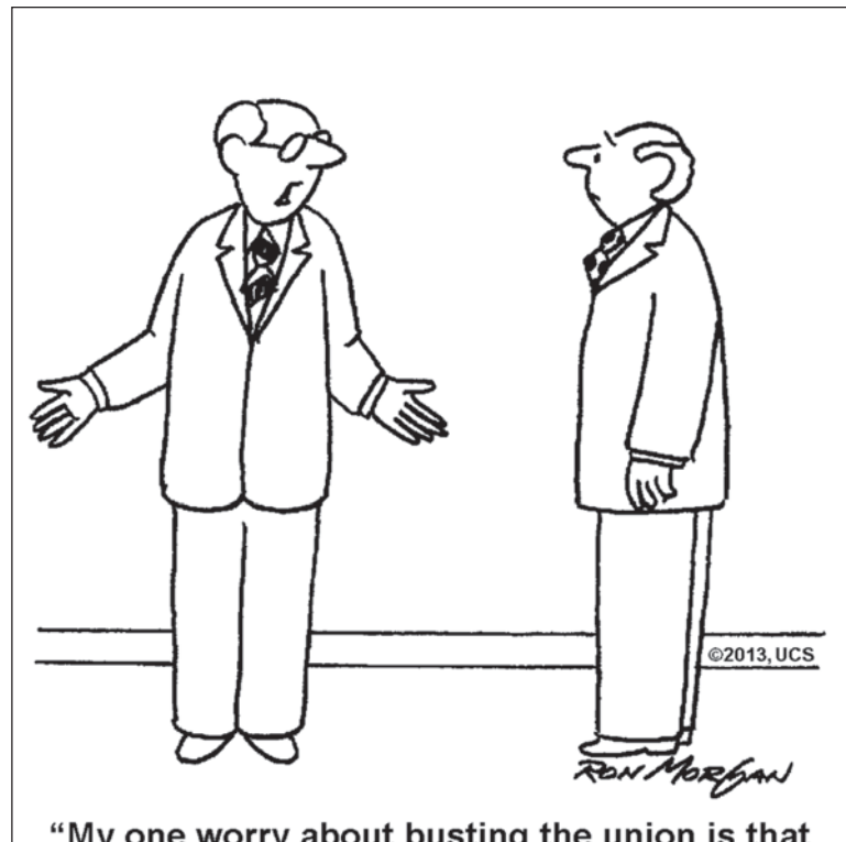
"My one worry about busting the union is that we'll no longer have anyone to blame but us."