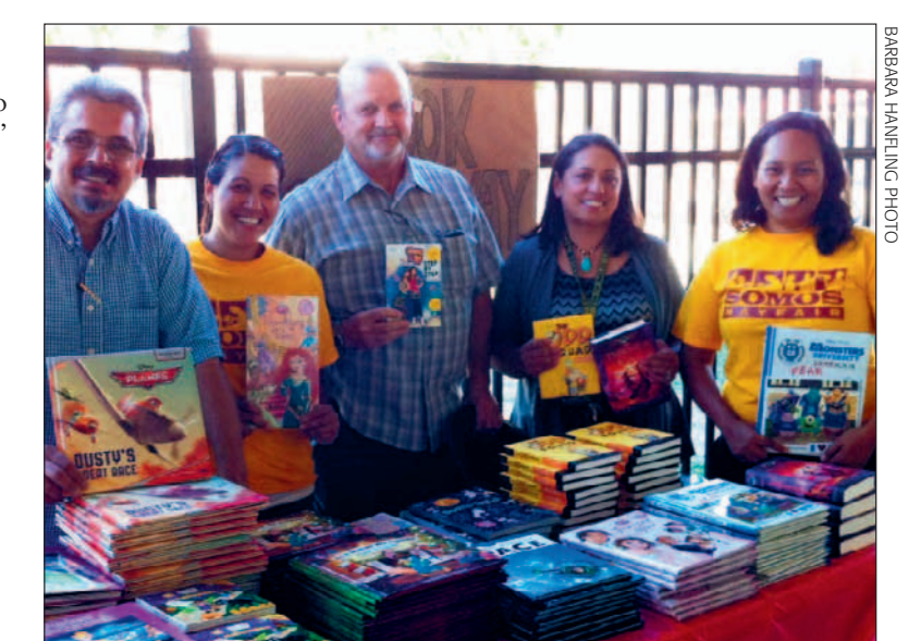
AFT Local 6157 delivers the gift of reading.

What Somos Mayfair didn't have was money and resources, and especially books. "We went