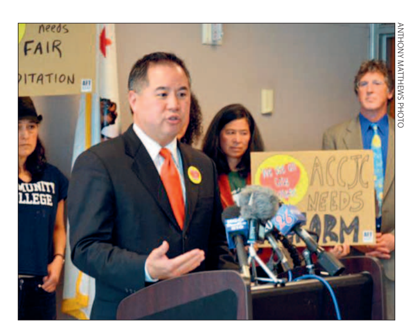
Assemblyman Phil Ting with CCSF faculty.

On other fronts, AFT 2121 has engaged in battles with an administration installed after the onset of the accreditation crisis. In January, credit classes at City College's campus serving a low-income Tenderloin community in San Francisco were abruptly relocated and the start of noncredit classes were delayed, ostensibly for reasons of seismic safety. Yet the college community was not consulted in the months