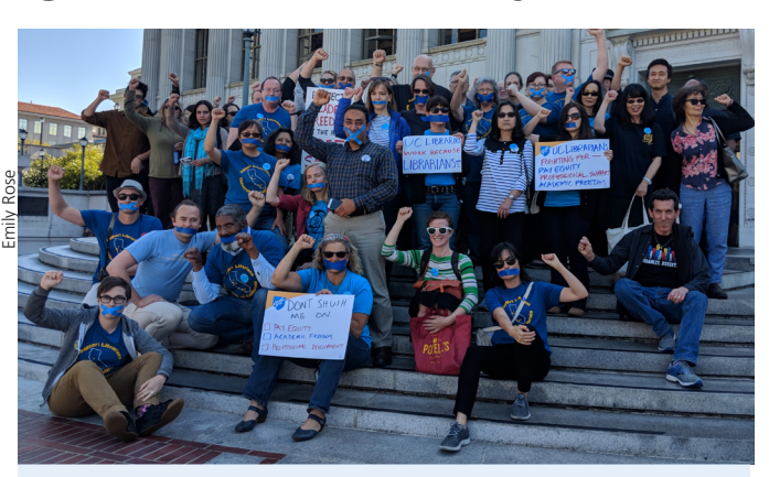
UC-AFT librarians, students and community allies rally on the steps of UC Berkeley's Doe Library.

The organizing committee carefully planned the details of the action. They delegated tasks to individual member activists ranging from media outreach and communications to turning out fellow librarians. Members of the organizing committee had