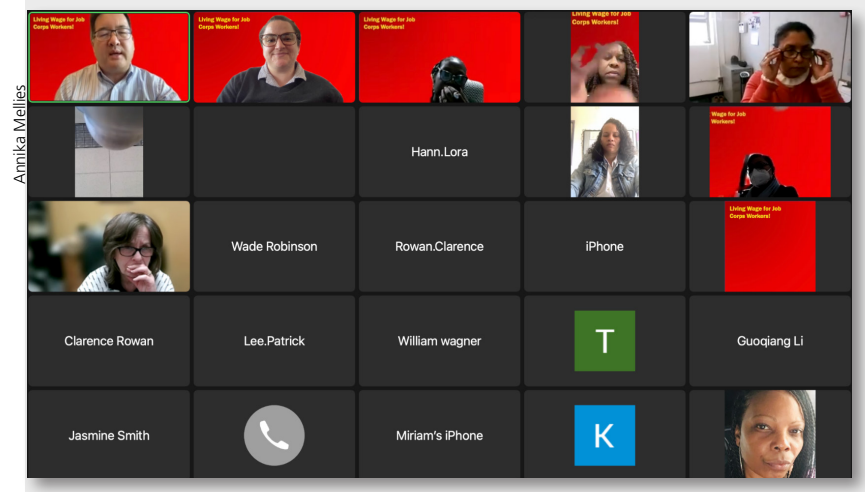
Local 6319 members join virtual negotiations with zoom backgrounds that say "Living Wage for Job Corps Workers!"

After almost a year of negotiations with new contractors MINACT and ETR, Treasure Island Job Corps Workers Union, Local 6319 voted 50 to 1 on March 30 to ratify their new contract. The victory was hard-won as workers had faced a number of challenges during negotiations including the CEO of MINACT abruptly leaving the zoom bargaining table in the middle of negotiations in response to worker demands for a living wage. Despite some tough setbacks, Local 6319 members won a great contract through their consistent presence and testimony at opening bargaining sessions and their strong relationships with one another. Highlights of the new contract include a wage