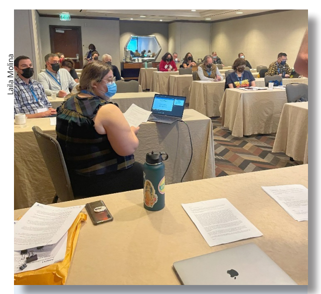
CFT organizers presented on recruiting and organizing members.

The event provided an in-person opportunity, not only for members to learn, but to celebrate the organizing victories that our locals have won throughout the pan-