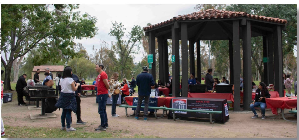
AdFac Members gather in-person for the first time in over two years to celebrate their union's accomplishments.

strategy. We also reached out to our union allies in the district, and Schools-First Federal Credit Union about presenting their financial resources for our members. We wanted our event to be both practical and enjoyable.