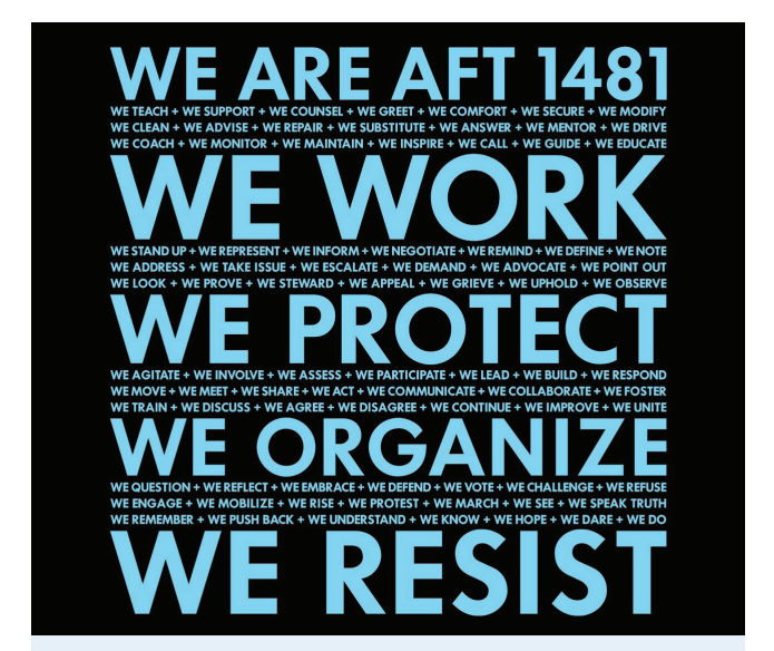
JFT's t-shirt artwork, which captures the local's message of classified and certificated union solidarity.

place and improved benefits. Over 30 members attended the action, sending