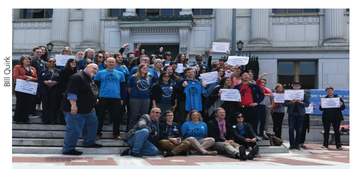
UC librarians and allies gather in front of Doe Library on the first day of bargaining.

On April 17, the University of California librarians opened this round of contract negotiations with their first bargaining session at Doe Library on the UC Berkeley campus. Wearing t-shirts and buttons made specially for the occasion that read "Librarians Will Not Be Silent," the representatives of UC-AFT filed into the room followed by other UC librarians and lecturers who had come from all over the state to give support to the table team and demonstrate union strength to the negotiators on the opposite side of the table. The first agenda item was introductions, and the librarians took this opportunity to explain the academic and educational value of their work. One by one, the members of the negotiating team described the world-renowned collections they curate and maintain, the scholars who come from far and wide to use these resources, the students who rely on the guidance of librarians as they learn to conduct specialized research, the professional development