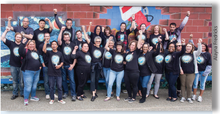
JFT members at Westmoor and Oceana High Schools during the campaign's "T-Shirt Tuesdays."

They began with lunchtime union meetings across all of their sites. Then came a button day starting on International Workers Day, May 1, with members wearing buttons in solidarity that read "To Value Our Students, Value Our Work & Value Our Voices." Next came the beginning of t-shirt Tuesdays and board actions on May 8 and May 15, where members spoke about the need for employees to have a voice in the work-