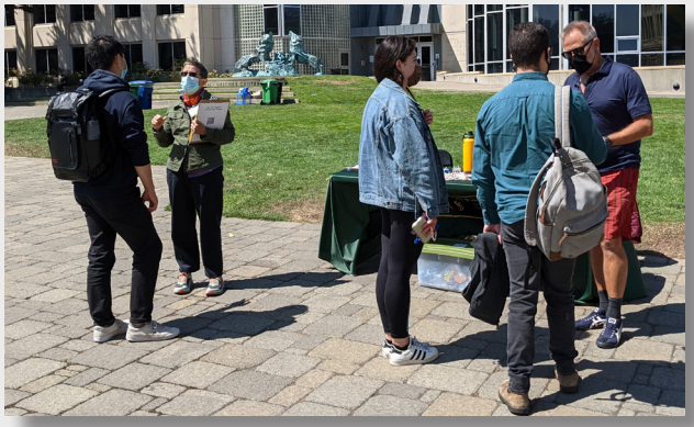
PTFA leaders talking to students and community members about what's at stake during this year's contract negotiations.

University of San Francisco Part Time Faculty Association, Local 6590 has hit the ground running in our contract campaign. During move-in weekend we contacted hundreds of students and their families, letting them know about our fight for fair pay, benefits and working conditions. The first week of classes we've been on campus every day with a table and flyers contacting our own members, full-time faculty, other campus workers, and students. Seventeen volunteers have worked over the last week to collect contact info and solidarity commitments from over 200 students and other non-members. In addition, 25 members have signed campaign commitment cards to take action. Next week, 10 volunteers will be making phone calls to recruit members to the first general membership meeting of the semester. We look forward to educating, organizing and mobilizing our members and the USF community to ensure we get a fair contract.