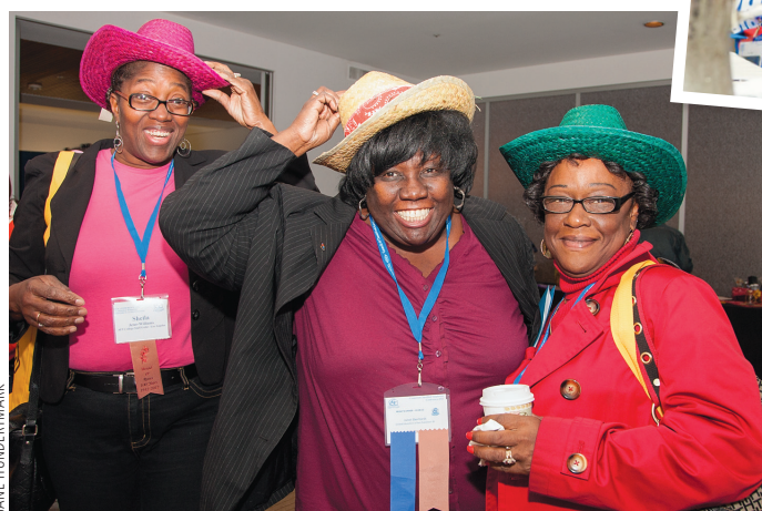
After a long day of inspiration and learning, attendees at the 2012 CCE Conference donned cowboy hats and kicked up their heels at a hoe-down.

College are also “committed to helping students one by one, but it’s a different relationship than in elementary or high school.”