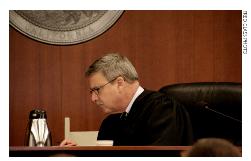
San Francisco Superior Court judge Curtis Karnow swatted away ACCIC's latest effort to get the CFT's suit dismissed.

In ruling on the city's suit, Judge Karnow found that the