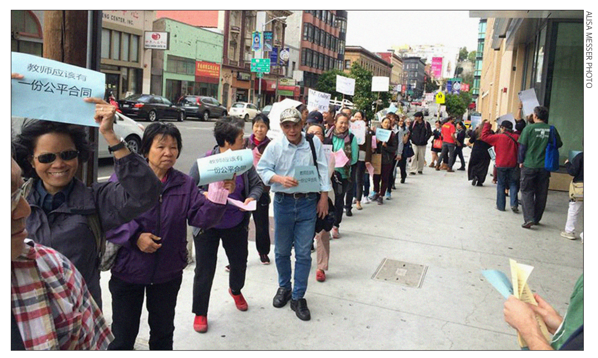
Community supporters join faculty in an informational picket outside the City College of San Francisco Chinatown Center while negotiations go nowhere inside.