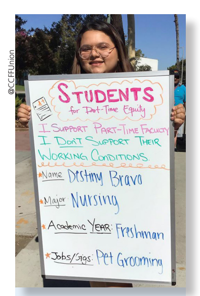
Students showing support for Cerritos College Faculty Federation, Local 6215 Adjunct Equity Week through an interactive white board activity.