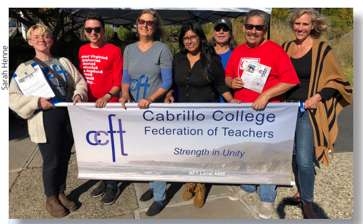
CFT organizers along with CCFT members and staff spent a week talking to Cabrillo College faculty about re-committing to their union and becoming COPE contributors.

In October, leaders from the Cabrillo College Federation of Teachers, Local 4400 (CCFT) worked with CFT to organize a membership outreach drive to educate members about gains made during bargaining. They asked all members to recommit to the union by signing new membership forms and asked nonmembers to sign up. In order to prepare for the board of trustees' races in 2020, members were also asked to contribute to COPE. With support from the northern California organizing team, leaders talked to 10% of the bargaining unit over the course of three days. Out