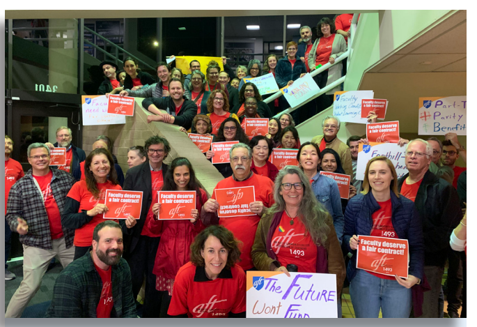
SMCC faculty amass at their district office for trustees' meeting.

The action was energetic, positive and the board room was packed with many faculty that board members had to enter through a back door rather than weave their way through the crowd.