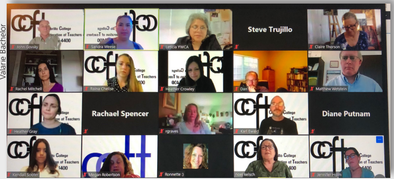
CCFT members mobilize to the June board of trustees ZOOM meeting.

Leaders at Cabrillo College Federation of Teachers, Local 4400 (CCFT) organized a phone bank in early April to reach out to bargaining unit members about COVID-19 and the impact it would have on spring 2020 courses. As everyone hurried to transition their classes online, members of the executive board, site rep. council and member volunteers took to the phones to check in on over 400 colleagues and share the important work the union was doing to protect their rights during the global pandemic. Through the phone bank and by using Hustle, they were able to mobilize over 100 faculty to