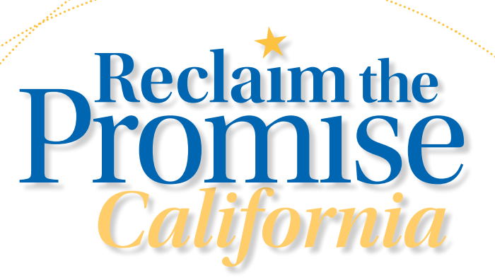
Convention 2014 🜟 March 21–23 🜟 Manhattan Beach Marriott

Division Councils will meet Friday night, March 21. There will be workshops on a wide range of topics. But the Convention isn't all work; there's time for fun as well, with receptions and get-togethers.