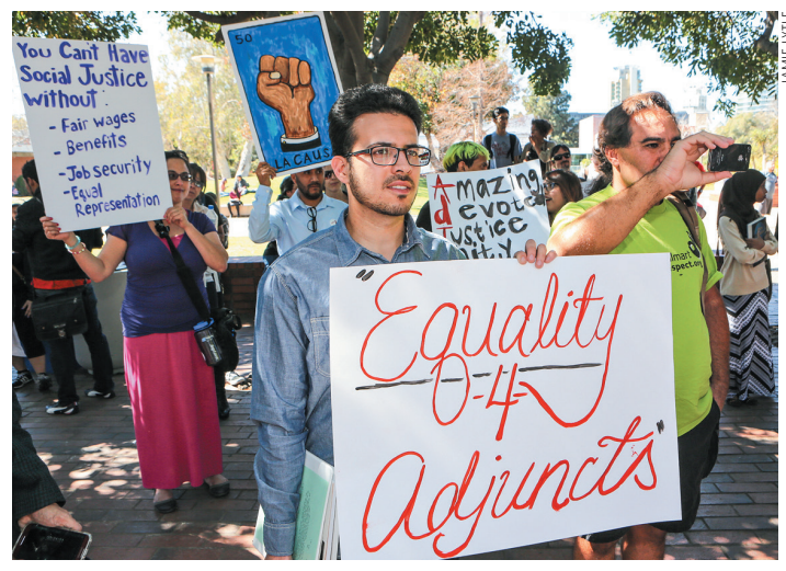
AFT Local 1931 rallied at San Diego City College as part of the National Adjunct Day of Action, spotlighting contingent employment in higher education.

"I found people coming up to me in the hallways offering me