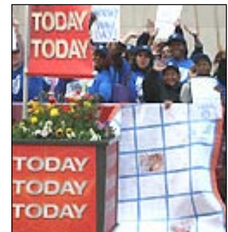
AFT members showing support for Worthy Wage Day, outside the today show with some of the Everyday Heroes Quilts.

bipartisan resolution in the U.S. House of Representatives. The resolution, HR Con. Res. 112, passed with 345 House members voting in favor and 73 members voting against it.