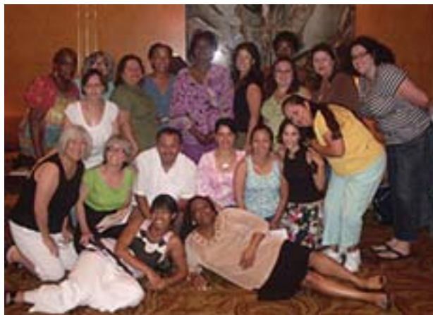
AFT ECE members and organizers who helped make house visits to local 1475 workers.